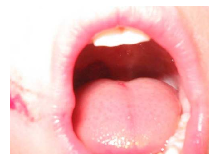
Fig. 1 Macerated right tonsillar pillar

a drink of water from it. The child now had pain and bleeding in the oropharynx. There was no other trauma sustained. The mother of the child immediately brought the patient to the local emergency department.