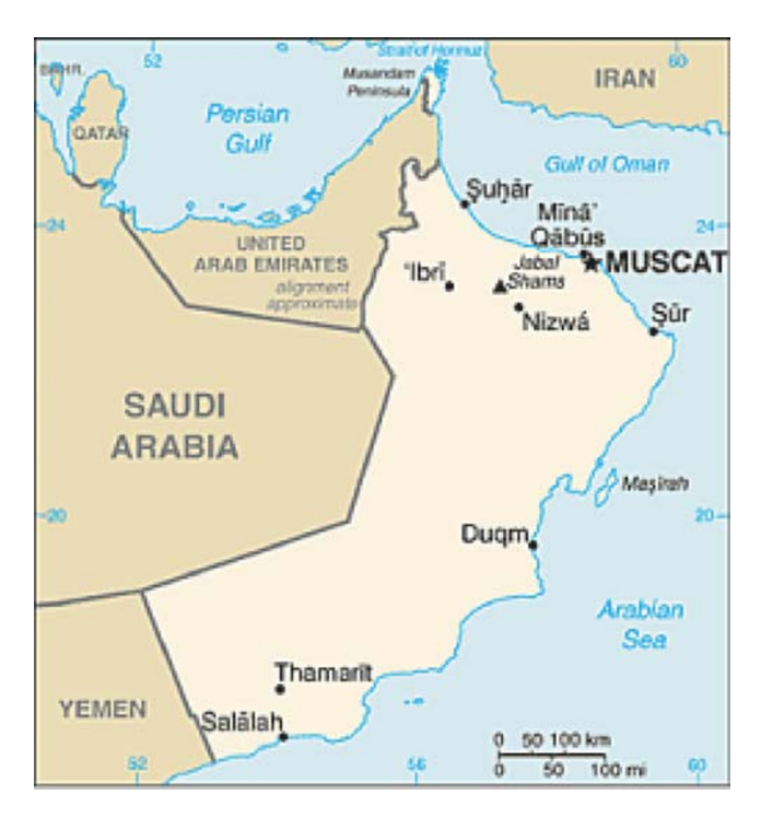
Fig. 1 Map of Oman (reproduced from the CIA World Factbook. Available via: https://www.cia.gov/library/publications/the-world-factbook/geos/mu.html)

At present, all tertiary and secondary hospitals in the country have emergency departments (EDs) as part of their