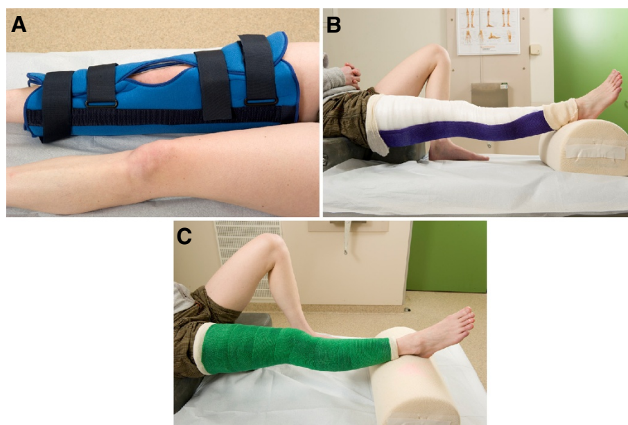
Figure 1 Conservative treatment in acute primary patella dislocation. A: brace. B: posterior splint. C: cylinder cast. Published with permission of the patient.

and a knee brace in patients with primary acute patellar dislocations. These inclusion criteria were used to make a selection based on the title and/or abstracts. Animal studies, case reports with fewer than five cases and studies on patellar fractures were excluded from the review. Independently and in duplicate, two of the authors performed a more thorough selection using the aforementioned exclusion criteria. Bibliographies of all the selected articles were reviewed for additional articles (Figure 2). The primary objectives were to compare redislocation rates and joint movement restrictions after treatment with cylinder casts, posterior splints and knee braces. Secondary objectives were to compare redislocation rates after surgery and conservative treatment. Results were expressed as relative risks (RR) with 95% confidence intervals (CI95%) or p values.