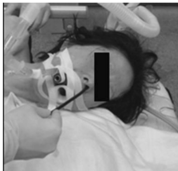
Figure 1 During the procedure, the ultrathin EGD was inserted through the left nostril.

After completion of the gastric lavage, a single dose of activated charcoal was administered through the nasogastric tube. Electrocardiography showed normal QRS and QTc intervals. No additional treatment, such as hypertonic sodium chloride infusion or systemic alkalinization, was