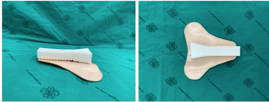
Fig. 2 Lateral and posterior views of the trachea and skin covering

Five items were evaluated, the size of the manikins, the ease of use, the similarity of the skin and trachea of the manikins compared with the actual human frontal neck area, the sensation of inserting the tube, and the overall benefit of the practice with the manikins. The satisfaction scores were rated from 1 to 5 points for each item, 1 being the least satisfaction and 5 the highest satisfaction.