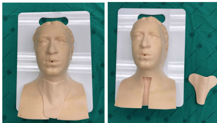
Fig. 1 The two parts of the manikin; the body and trachea/skin covering

After the materials testing, we gathered a group of 40 experienced airway management physicians and last year residents from the Departments of Emergency Medicine, Otolaryngology (Head and Neck Surgery), Surgery, and Anesthesiology and asked them to evaluate their level of satisfaction with various aspects of practicing emergency anterior neck access with the new manikins.