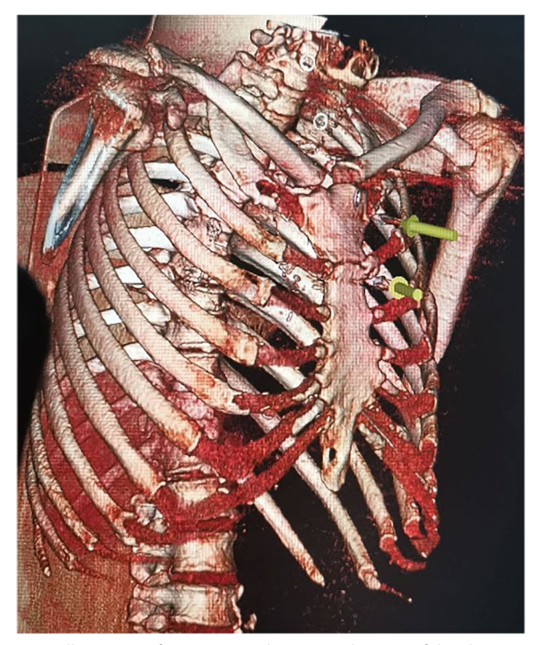
Fig. 1 Illustration of 3D computed tomography scan of the chest showing localizations of two metal fragments in the lung (marked with two yellow pins)

and the decision was made to temporarily keep the fragment at the level of the intercostal space by using magnetic control system (Fig. 3). The Mikulicz forceps were inserted into the area of the metal fragment (2.5 \times 2.0 \text{ cm}) location followed by fragment fixation and removed from the chest (Fig. 4). The patient was discharged from the hospital 2 weeks after the surgery and received 30 days of vacation according to the decision of the military-medical committee.