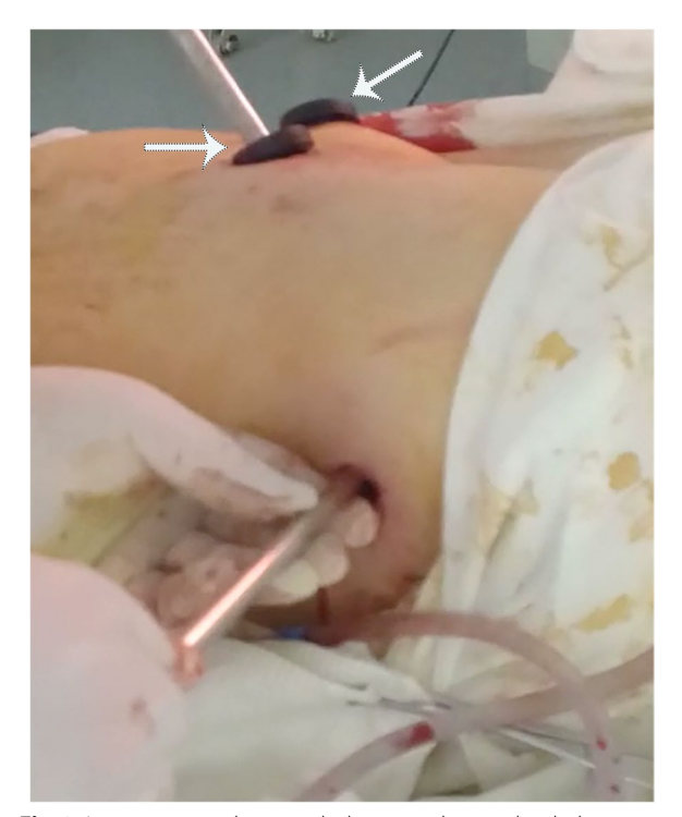
Fig. 2 Intraoperative photograph showing inlet gunshot hole on the left side of the patient which is used as a thoracic port for video-thoracoscopic instruments. Two magnetic tools were used to fix the metal fragments in the lung before helping with its removal (marked with two arrows)

In this case report, we presented our clinical experience in the management of gunshot wounds with the application of VATS with magnet guidance to remove ferromagnetic fragments in combat patient. We believe this case report provides additional knowledge about the role of minimally invasive surgery and the magnets in the active war conditions accompanied by the violation of humanitarian law by the Russian army and in terms of limited medical resources in Ukraine [2, 14, 15, 17]. In regards to our previous reports, management of gunshot injury to the lungs is presented for the first time in the patient injured during the active (invasion) period of the Russo-Ukrainian war. This study is also supported by previous reports of the possibility to apply modern technologies and tools in conditions of limited medical recourses and