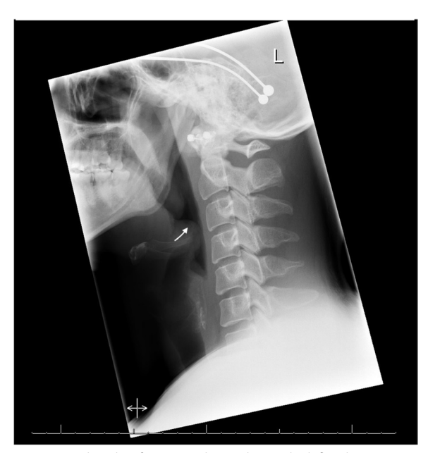
Fig. 1 Lateral neck soft tissue radiograph: poorly defined and thickened epiglottis. The arrow points to the thumb sign which is commonly associated with acute epiglottitis

The patient received intravenous Dexamethasone In the emergency department, which immediately improved his shortness of breath. A throat culture was negative for group A, B, and C Streptococcus. COVID-19 was ruled out with a PCR nasal swab. The total peripheral white blood cell count was mildly elevated, but the rest of the renal and metabolic panels were normal. A lateral soft tissue radiograph of the neck showed a poorly defined and thickened epiglottis with a classic thumb sign, indicating acute epiglottitis (Fig. 1).