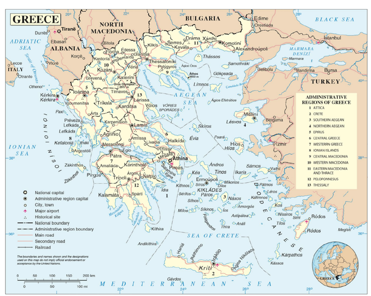
Fig. 1 Map of Greece [1]

In 1983, Greece passed a law establishing a national health system ( Gr: Ethniko Systima Ygeias (ESY)), universal coverage of the insured population, and equal