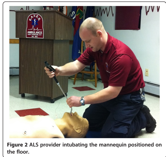
Figure 2 ALS provider intubating the mannequin positioned on the floor.

intubation attempts will be the same when using the CVS. For the purpose of this study, a difference in the total time of greater than or equal to 10 s would be considered the MCID. 3) ALS EMTs will be satisfied with the CVS and perceive it to be useful to their practice.