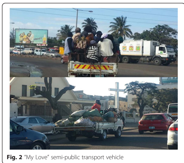
Fig. 2 “My Love” semi-public transport vehicle