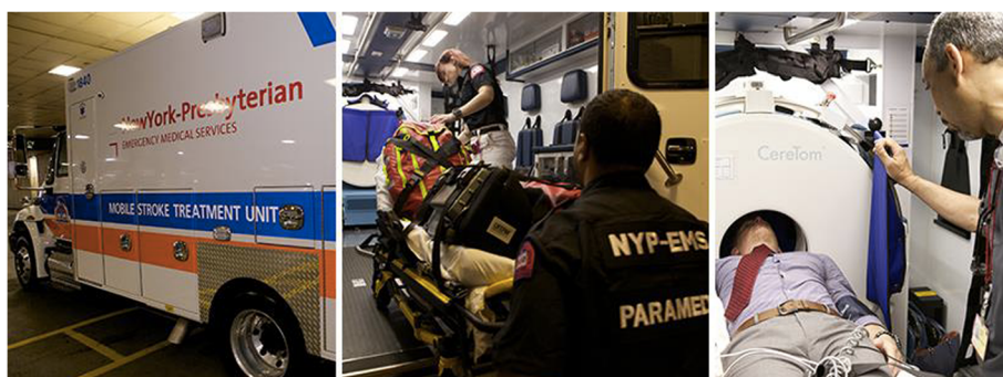
Fig. 1 NYP Mobile Stroke Unit

We have also received great praise from patients. As of June 2017, approximately 2800 patients have benefited from this service and their patient experience scores have been in the 99th percentile. Each patient also