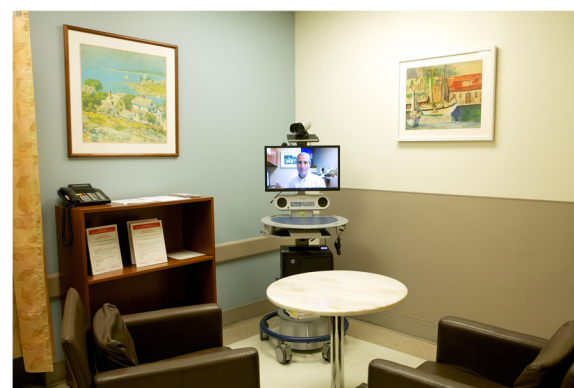
Fig. 2 NYP ED Express Care Service Patient Room

Despite the passage of the Affordable Care Act (ACA), the number of emergency department visits has continued to rise nationally [8]. In the face of increasing volume and capacity challenges, healthcare systems must devise innovative solutions to ensure high quality and efficient care, while providing an outstanding patient experience. The innovative response of NewYork-Presbyterian and Weill Cornell Medicine was to create digital emergency department capability. One such example is the launch of the first Emergency Department-based Telehealth Express Care Service. Patients with minor complaints arriving at the emergency departments of New York-Presbyterian/Weill Cornell Medical Center and New York Presbyterian/Lower Manhattan Hospital are given the option of a virtual visit through real-time video interactions with a board certified Weill Cornell attending physician. The virtual visit is initiated after the patient has been triaged and had a